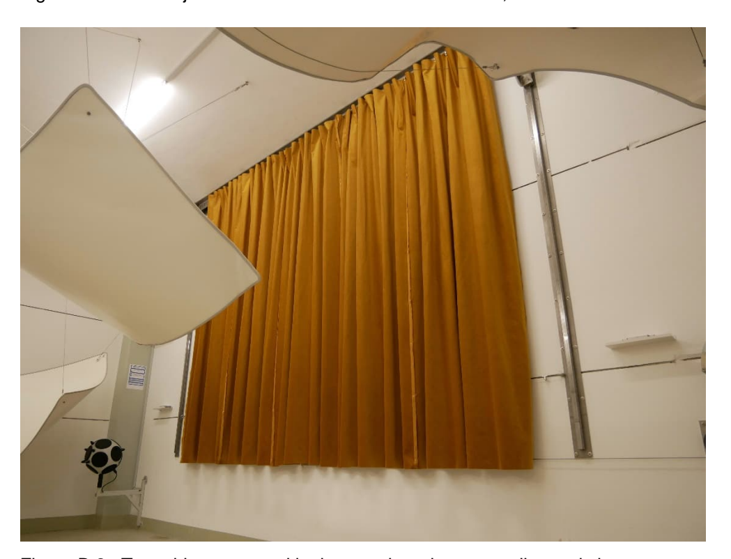
Figure B.2. Test object mounted in the reverberation room, diagonal view.